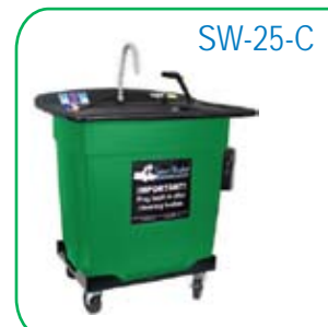
Combo Brake/Parts Washer Both Electric and Air Operated Pump / Brush