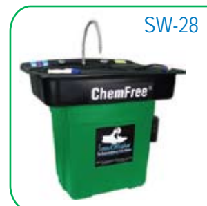
SuperSink Parts Washer