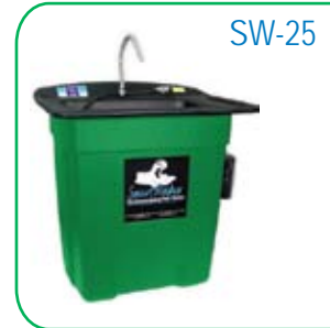
Signature Parts Washer