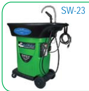
Mobile Parts/ Brake Washer

the use of biological agents, such as microbes or plants, to remove or neutralize contaminants.