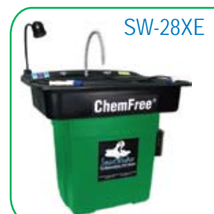
SuperSink XE Parts Washer 2 Work/Brush Stations, Light Kit, Parts Basket